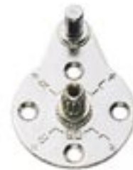
Mounting Plate SDS-A